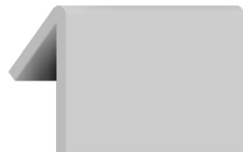
Single Fold 135°