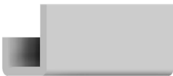
Double Fold 90°/90°

Using the available attachment system, simply insert the panels with short clips or with a continuous rail. Clips are available in 3" lengths and rails are available in 8' lengths.